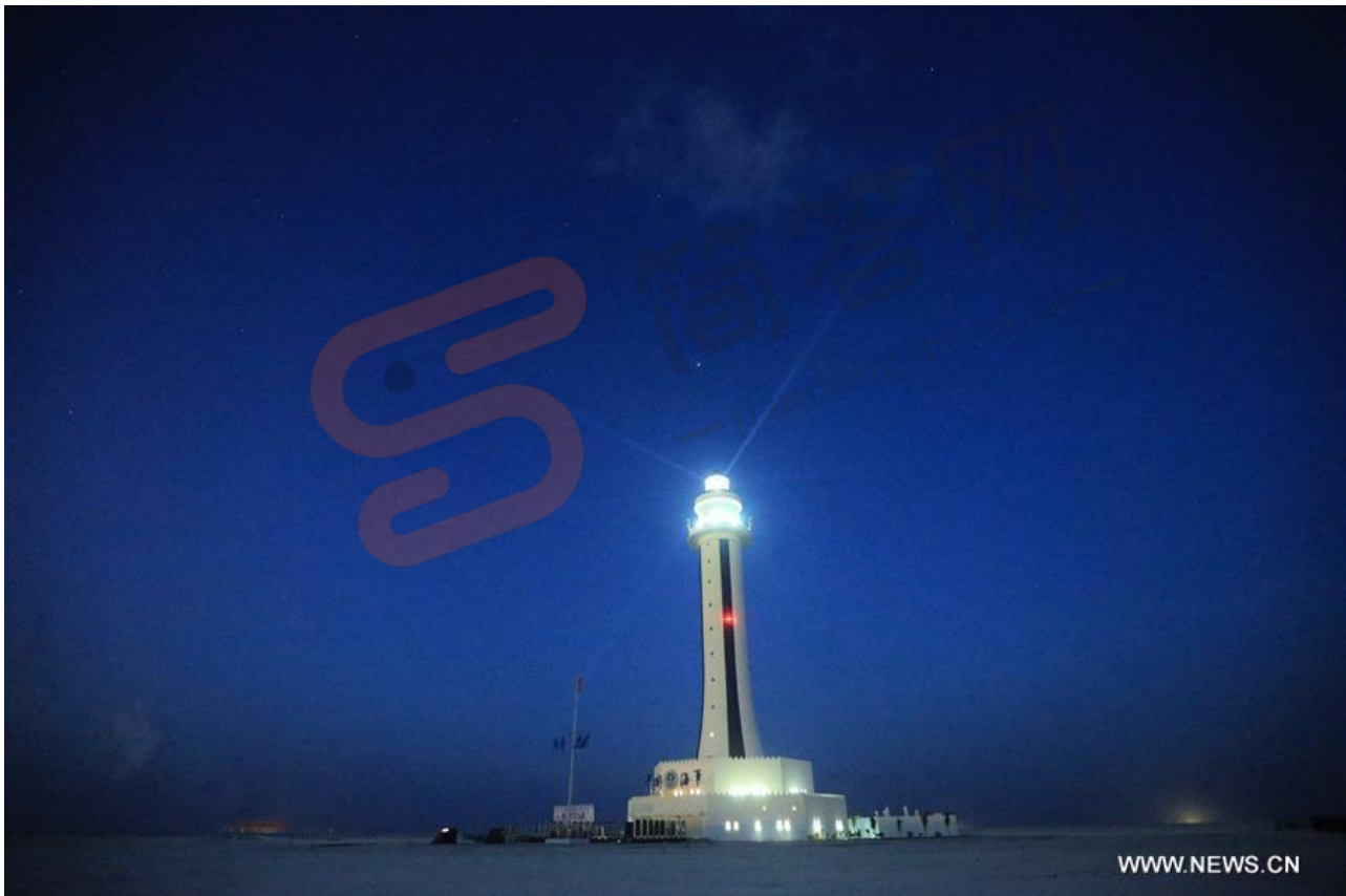
Photo taken on April 5, 2016 shows the lighthouse on Zhubi Reef of Nansha Islands in the South China Sea, south China. China's Ministry of Transport on Tuesday held a completion ceremony for the construction of a lighthouse on Zhubi Reef, marking the start of its operation. The lighthouse can provide efficient navigation services such as positioning reference, route guidance and navigation safety information to ships, which can improve navigation management and emergency response.

BEIJING, April 5 (Xinhua) -- China's Ministry of Transport on Tuesday held a completion ceremony for the construction of a lighthouse on Zhubi Reef, marking the start of its operation.