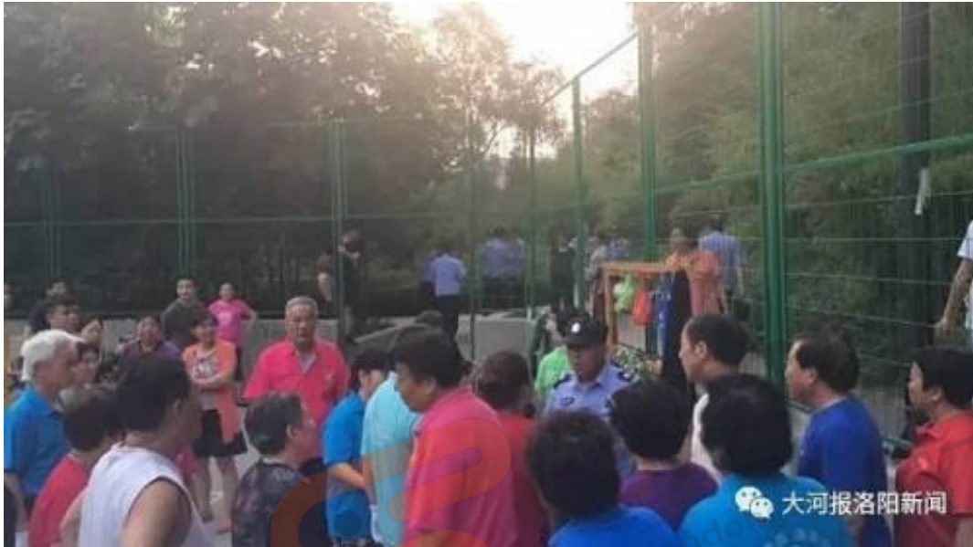
Dahe Daily Photo

However, the deafening levels at which radios blast and big turnouts have drawn frowns from residents and passersby.