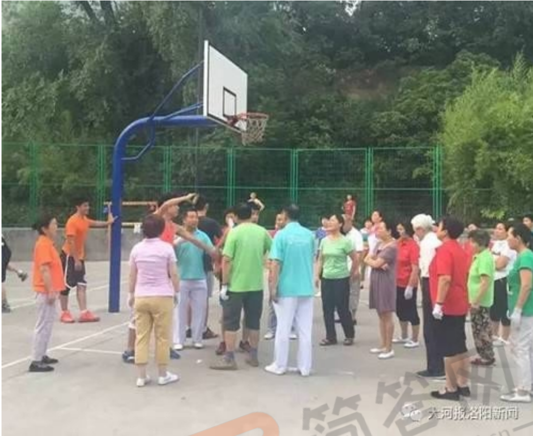
The senior dancers got into dispute with young men playing basketball.

The brawl erupted on Wednesday when senior citizens broke into the court while the young men were holding a basketball match, and immediately got their groove on.