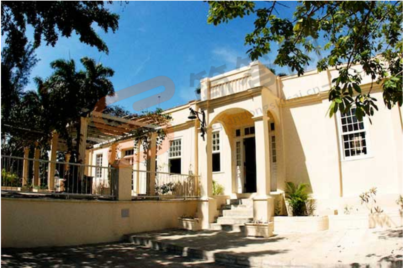
The Hemingway Museum at Finca Vigia in Cuba

The Hemingway Museum at Finca Vigia in Cuba is where the great American writer lived during the last 21 years of his life and where he produced some of his best-known works, including “ For Whom the Bell Tolls ” and “ The Old Man and the Sea. ”