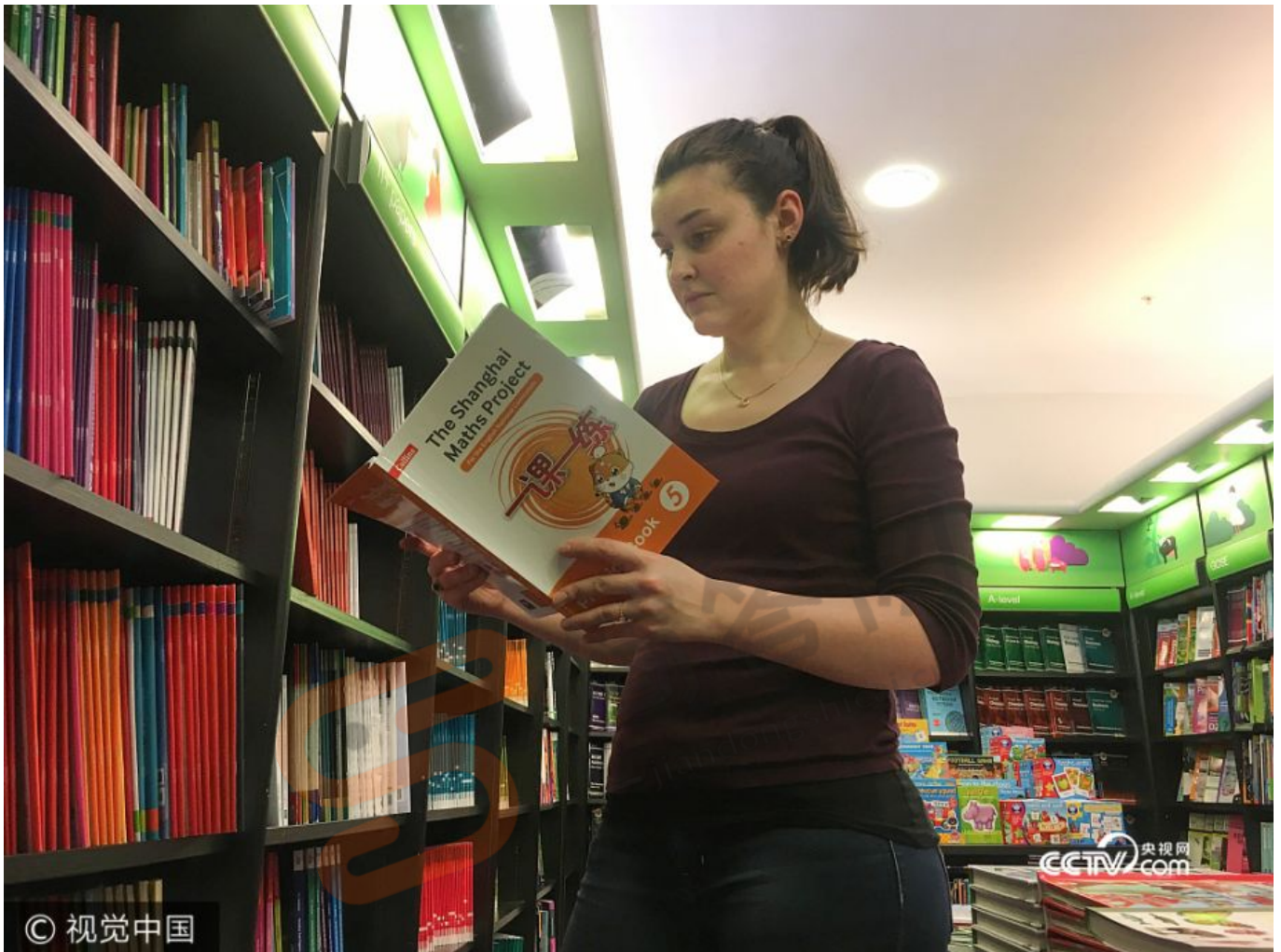
Photo shows a lady reading The Shanghai Maths Project at The Waterstone's in Piccadilly, London June 8. based on maths teaching in Shanghai, this series of practice books for years 1–11 will provide complete coverage of the maths curriculum for England. The UK government has launched a $50 million investment in Chinese maths across Britain. That has been followed now by International publishers Harper Collins producing a number of textbooks using the Shanghai Maths System to sell into UK schools.