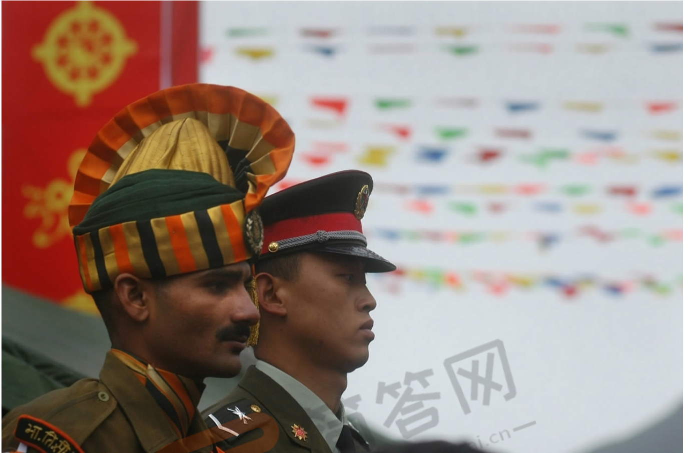
Chinese and Indian soldiers standing guard at China-India border.

This row began when Indian border troops intruded across the China-India boundary at the Sikkim section, entering Chinese territory to obstruct road-building by Chinese workmen.