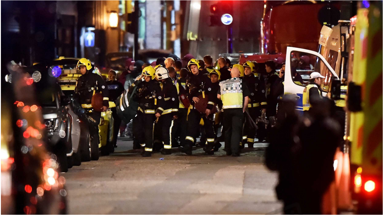
Emergency services personnel attend to an incident near London Bridge in London, June 4, 2017.