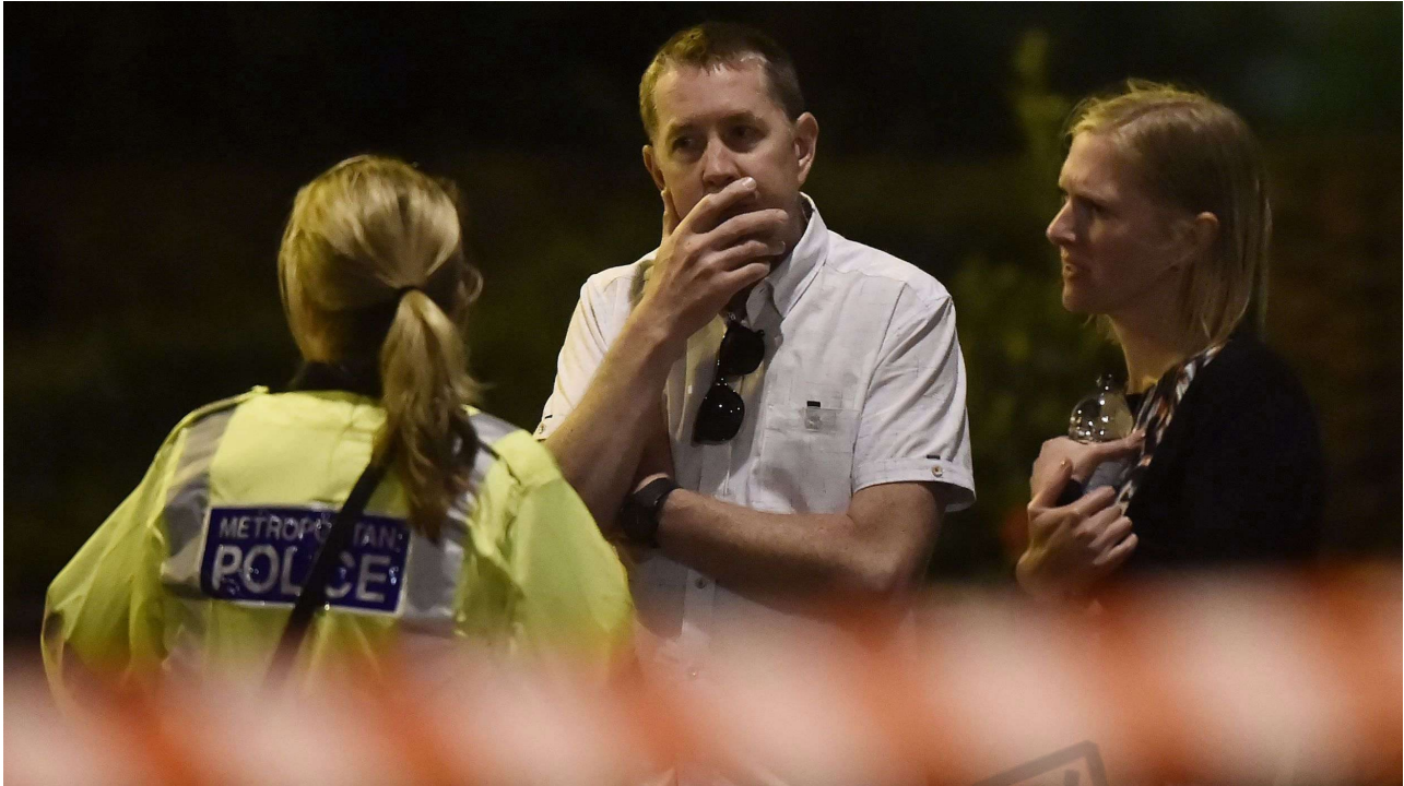
People speak with a police officer after an incident near London Bridge in London, June 4, 2017.

French President Emmanuel Macron said in a tweet, "France stands by the UK, today more than ever! My thoughts are with the victims and their families."