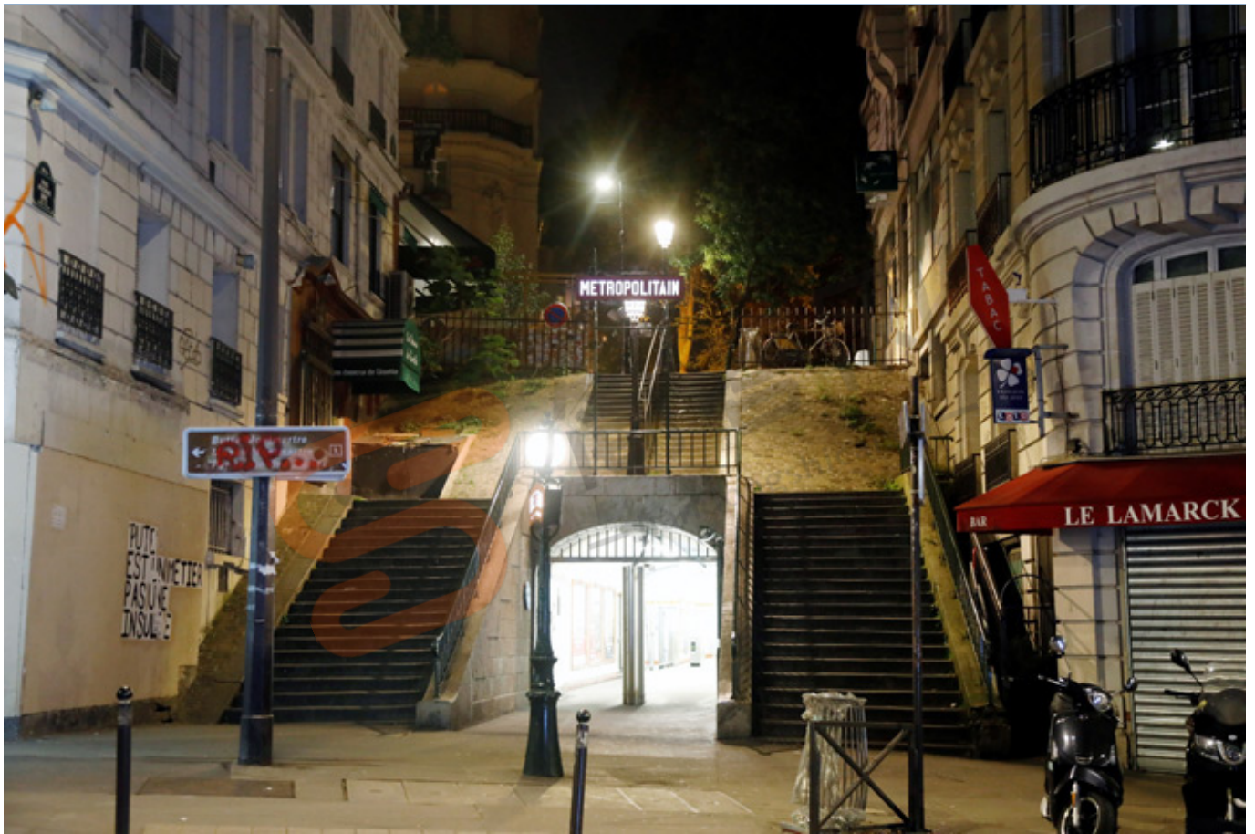
Empty streets are seen in Montmartre during the late-night curfew due to restrictions against the spread of the coronavirus disease (COVID-19) in Paris, France, October 17, 2020.

10月19日，全球累计新冠确诊病例超4000万例。欧洲疫情近期快速反弹，新冠病例增速已超过美国。面对来势凶猛的第二波疫情，欧洲各国纷纷加强了限制措施，重新进入疫情最高警戒状态。