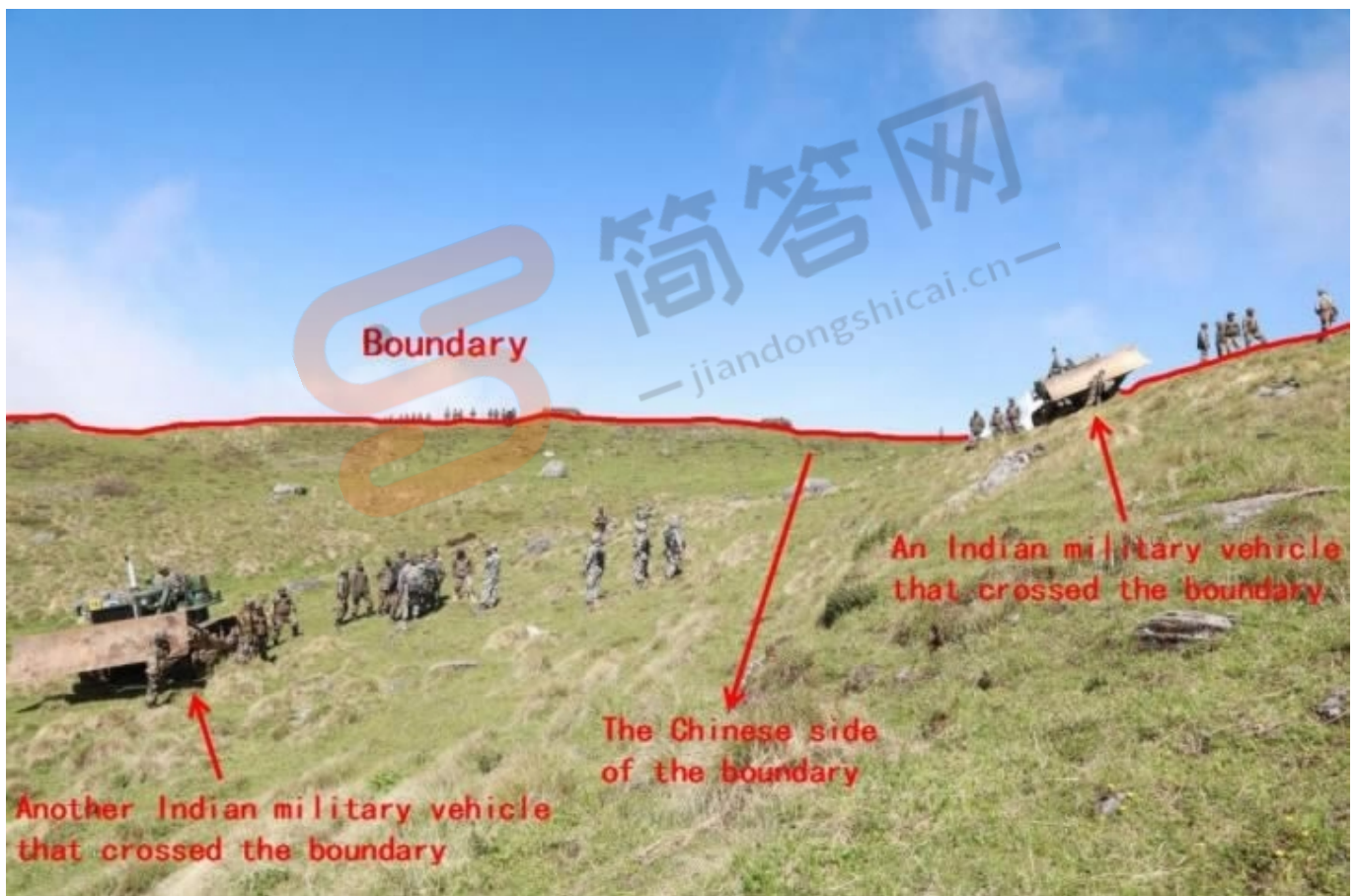
The Indian troops' trespass into Chinese territory.

The Chinese armed forces have shown a high level of restraint since Indian troops illegally crossed the border at the Sikkim section into Chinese territory on June 18, but "goodwill has its principles and restraint has its bottom line," Ren said, adding that the Chinese military will resolutely protect the country's territorial sovereignty and security interests.