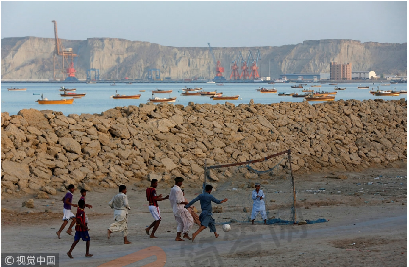
Residents play with a soccer ball near a makeshift wooden goal post, against the backdrop of Gwadar port in Gwadar, Pakistan, on April 10, 2017.