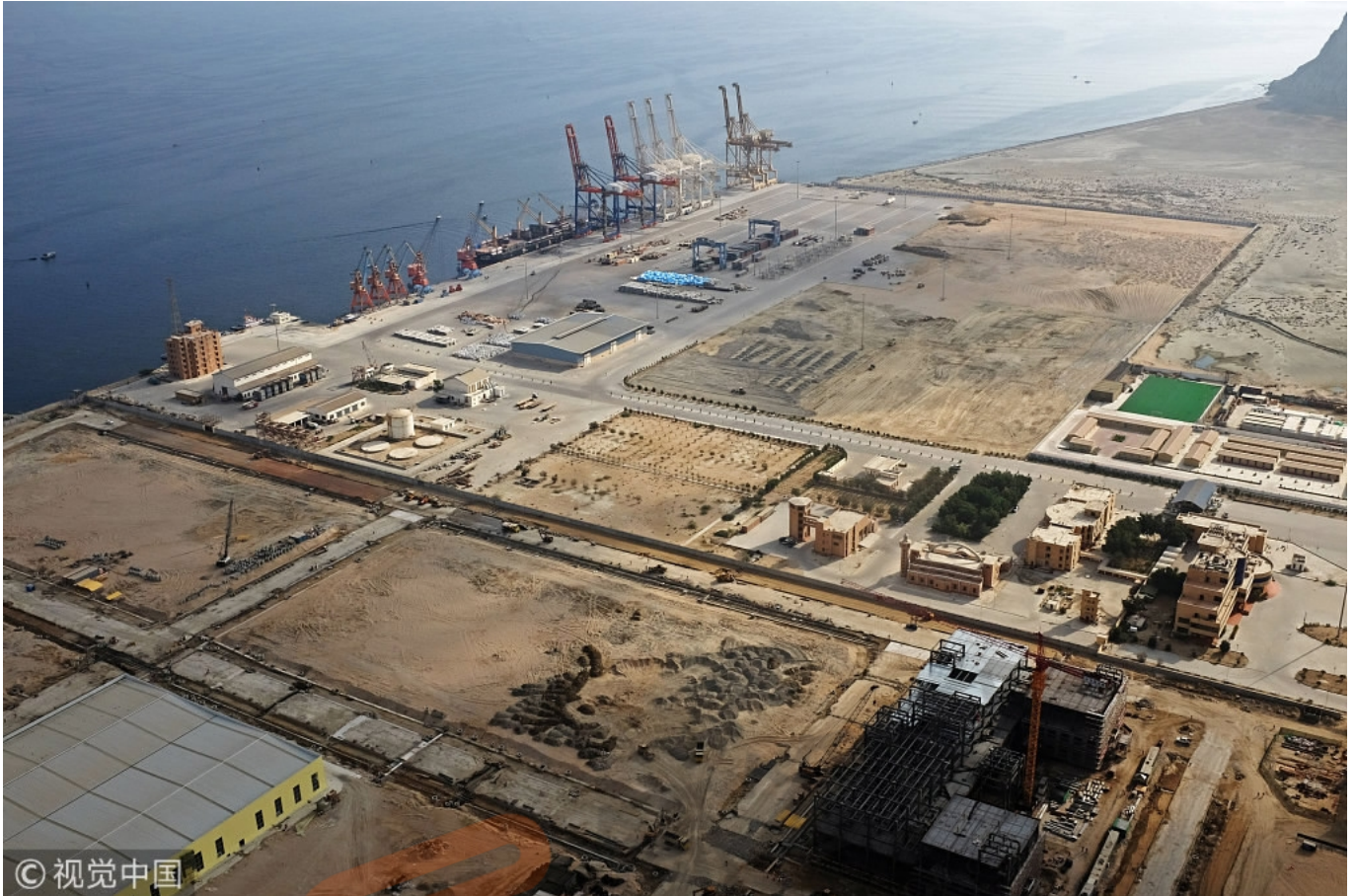
A general view of Gwadar port in Gwadar, Pakistan, on October 4, 2017.