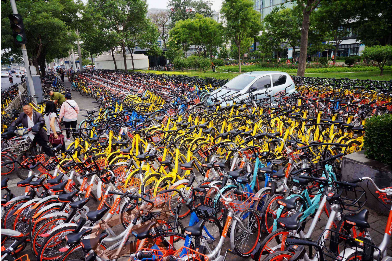
Dock-less sharing bikes at a Beijing subway station.

Earlier this year, ofo settled out of court for an undisclosed amount with a user who sued the company over an alleged brake issue that he said caused him to fall off his bike.