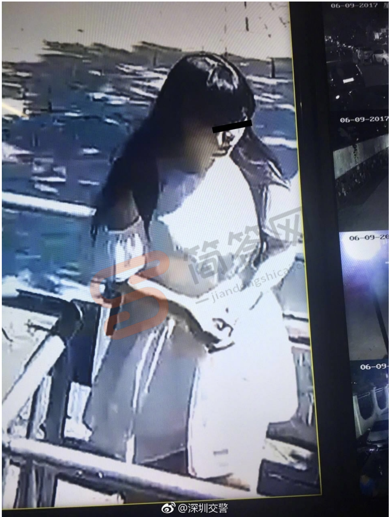
The 29-year-old suspect is tracked via surveillance camera.