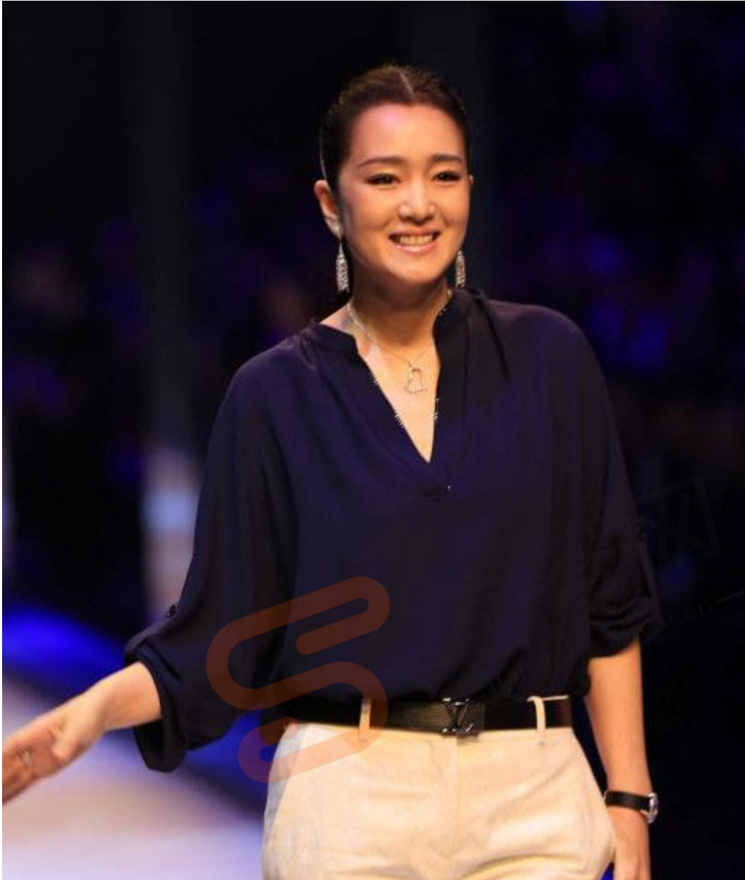
Chinese actress Gong Li

"I have several swimsuits myself, although I'm not an excellent swimmer. But I do think this is a good concept, and designer swimwear is a terrific idea, because you can actually style your look, play with the colours and the way you wear them," actress Gong Li said.