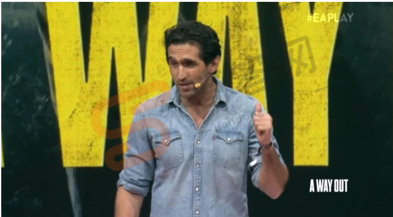
Josef Fares explains his second game A Way Out to a crowd at E3 2017.

Yes, this game even has a plot writer, who was previously a movie director.