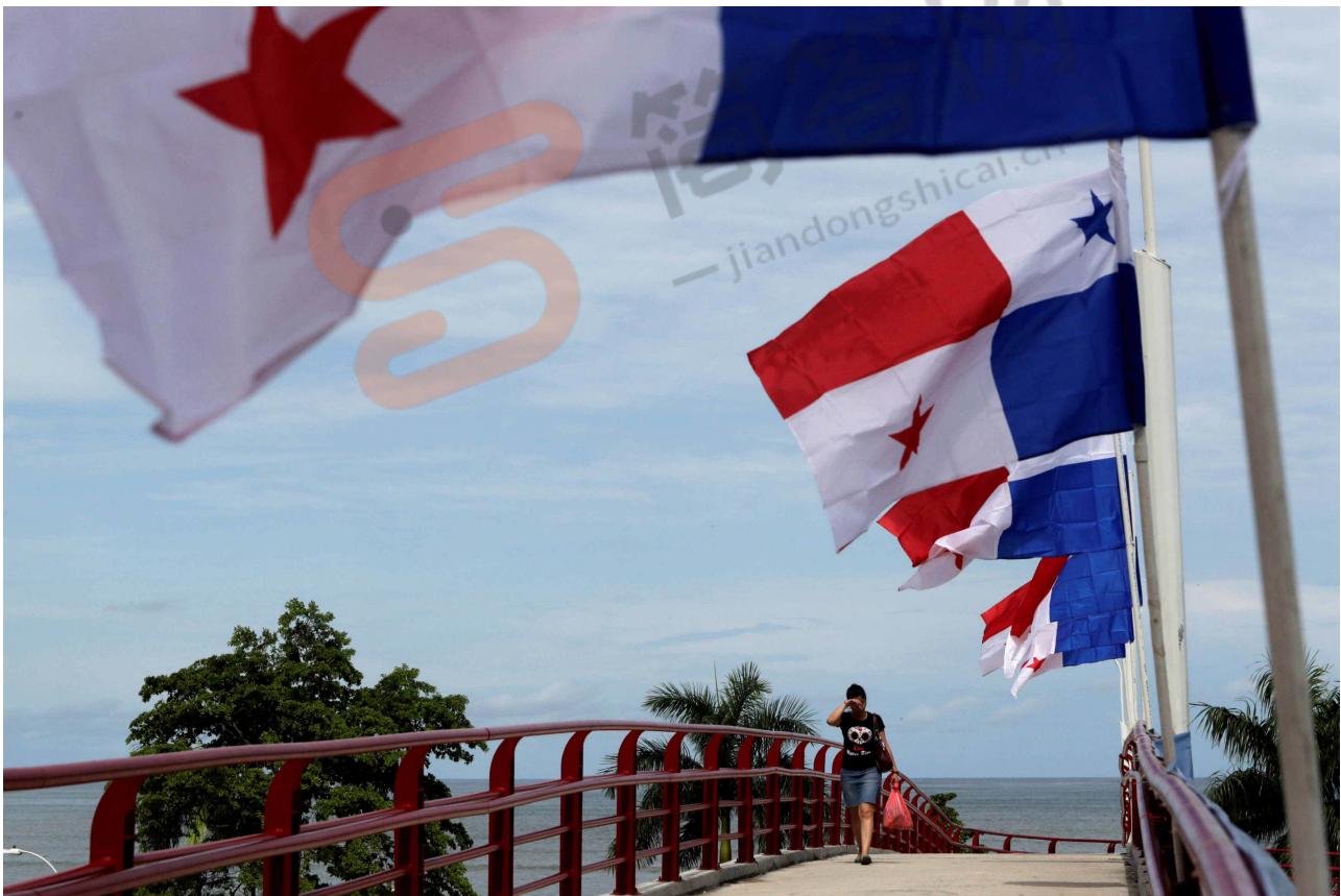
A woman walks next to Panama flags a day before the inauguration of the Panama Canal Expansion project, in Panama City, Panama June 25, 2016.

Establishment of diplomatic ties 'stands to sense'