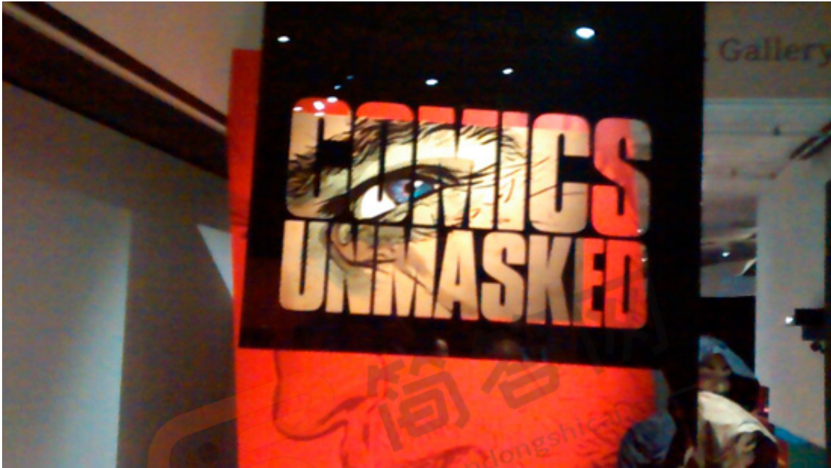
Comics Unmasked: Art and Anarchy in the UK