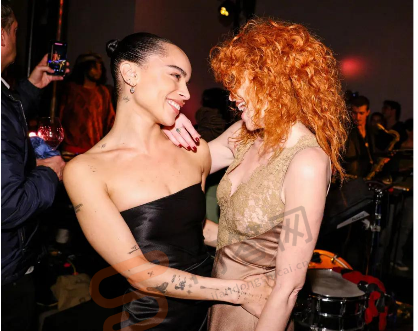
近日，又有网友看到，佐伊·克拉维兹(Zoë Kravitz)和好闺蜜霉霉(Taylor Swift)在纽约相聚，两人畅聊了八小时