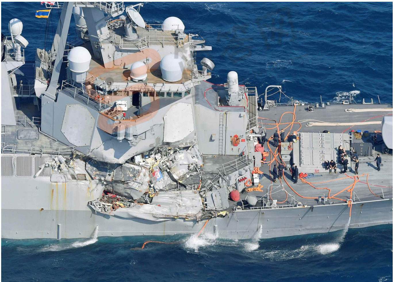
US destroyer USS Fitzgerald, damaged in a collision with a Philippine-flagged merchant vessel, is seen off Shimoda, Japan on June 17, 2017.