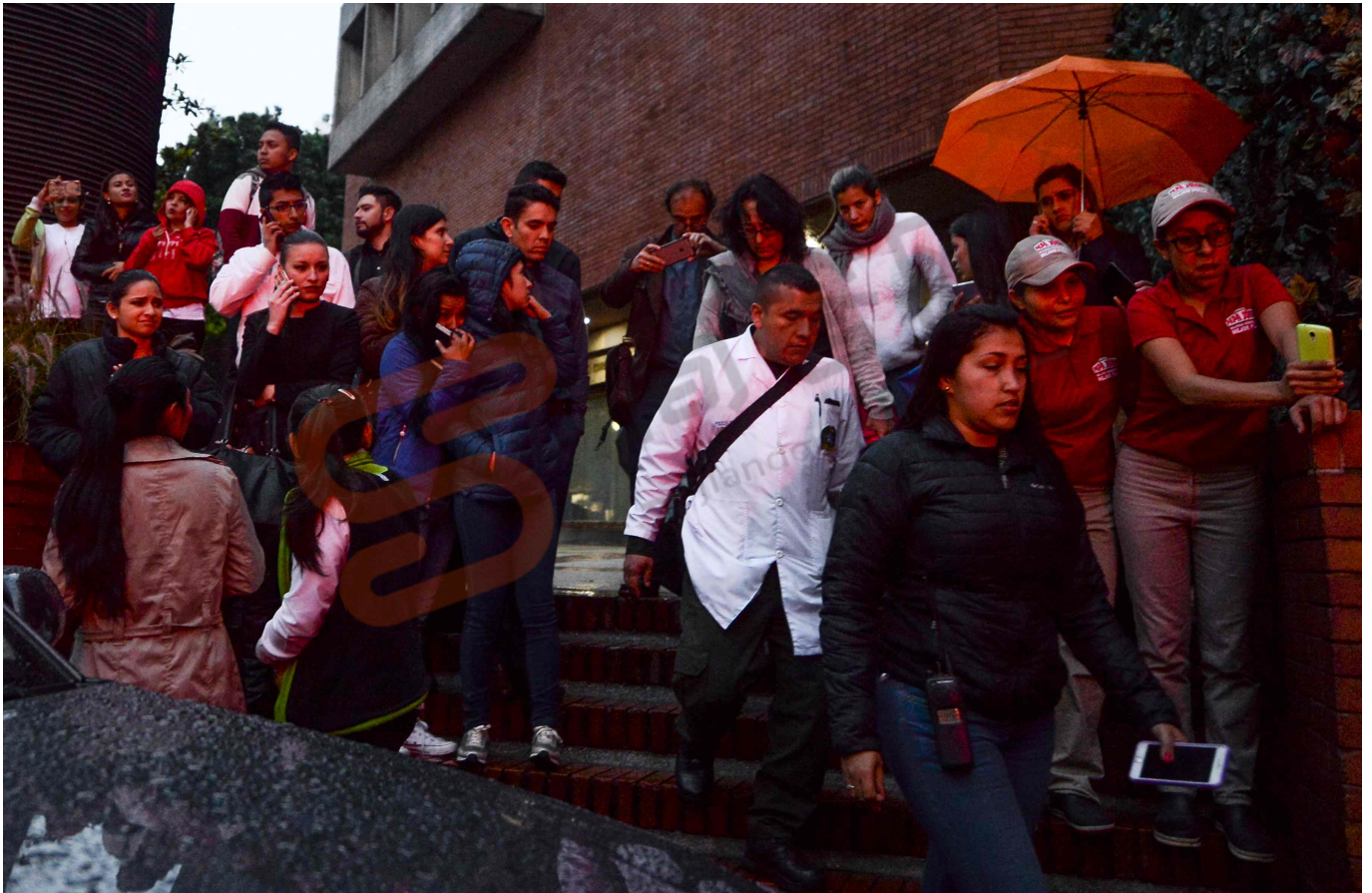
Locals stand next to a shopping center following an explosion inside the building in Bogota, Colombia on June 17, 2017.

The blast happened at around 5 p.m. local time. Witnesses said the blast occurred in the second-floor women's bathroom at Centro Andino in Bogota's central tourist district.