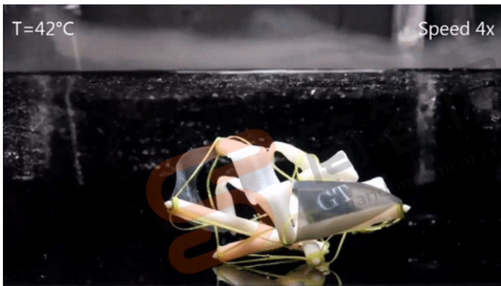
A 3D-printed structure unfolds itself when exposed to heat.

The research team used 3D printers to create a small structure that expands when exposed to heat, a method called 4D printing, in which a 3D-printed object changes its shape after being exposed to heat, according to a Georgia Tech press statement.