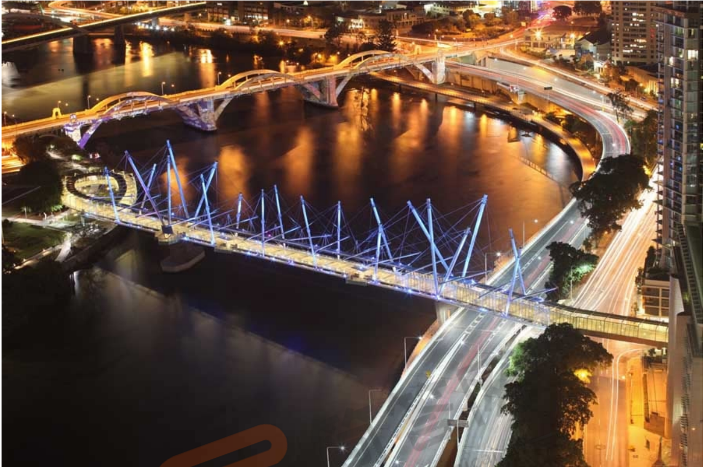
The Kurilpa Bridge in Melbourne is one of the largest structures on the Earth to utilize the principle of tensegrity.

"That's the reason there's a heavy amount of interest right now in researching the use of tensegrity structures for outer space exploration," Paulino added. "The goal is to find a way to deploy a large object that initially takes up little space."