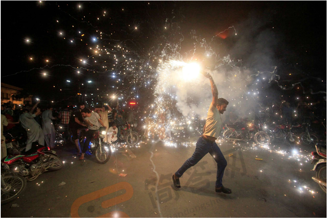
Pakistani cricket fans cheer after Pakistan defeated India in the Champions Trophy finals, in Lahore, Pakistan June 18, 2017.

The cricketing rivalry between Pakistan and India has been transformed into one of the world's greatest sporting enmities over the years.