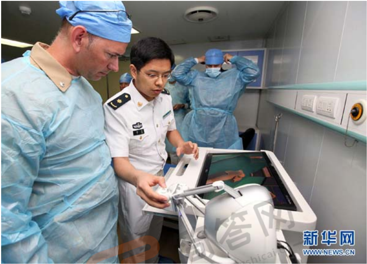
China's Peace Ark participate in the drill.