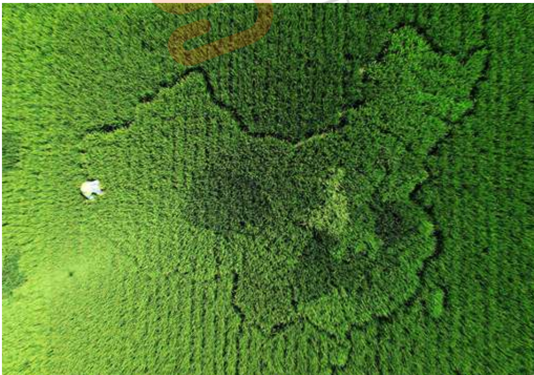
A map of China made from rice shoots can be seen in a paddy field in Fengjing county, Shanghai, on September

9?27????????????????????30,000????????????????????